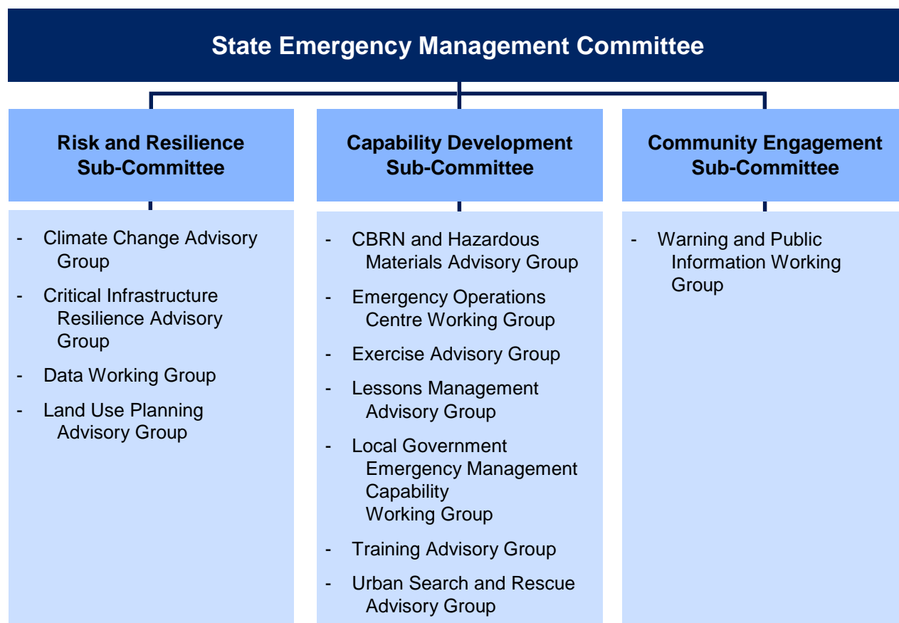
Organisational Chart of SEMC Sub-committees as at 30 June 2019

Existing working and advisory groups were restructured to align to the new sub-committee structure. The Mitigation and Capability sub-committees were closed at SEMC 110 in September 2018.